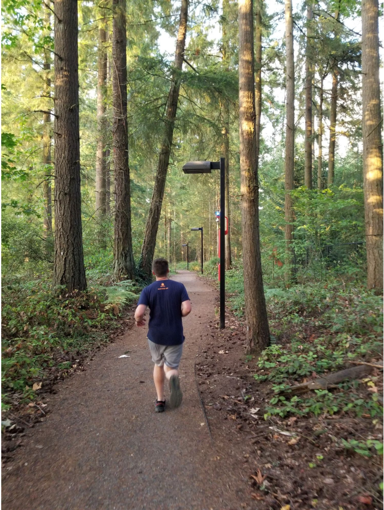
Fig. 1: Enjoying a jog through the beautiful forest around the Microsoft Redmond campus!